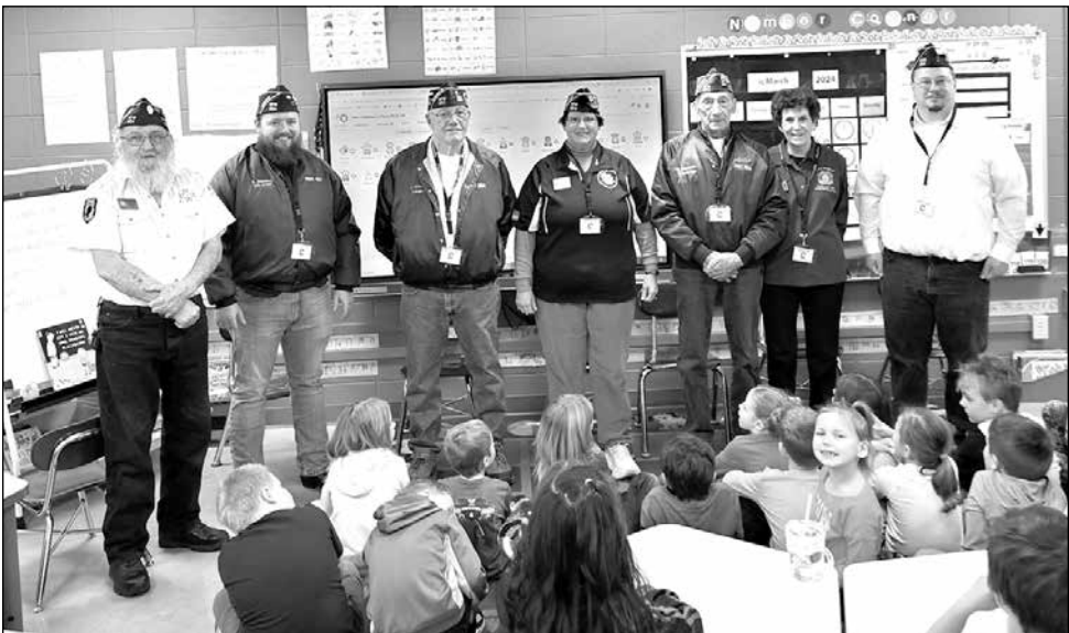
Post and Auxiliary members from Post 664 in Clintonville pose with some of the 85 First Grade students at Clintonville ES during their annual Flag Etiquette presentation. Brochures, Pledge of Allegiance pencils, coloring books and U.S. Presidents rulers were also distributed, and of course, there was milk and cookies!