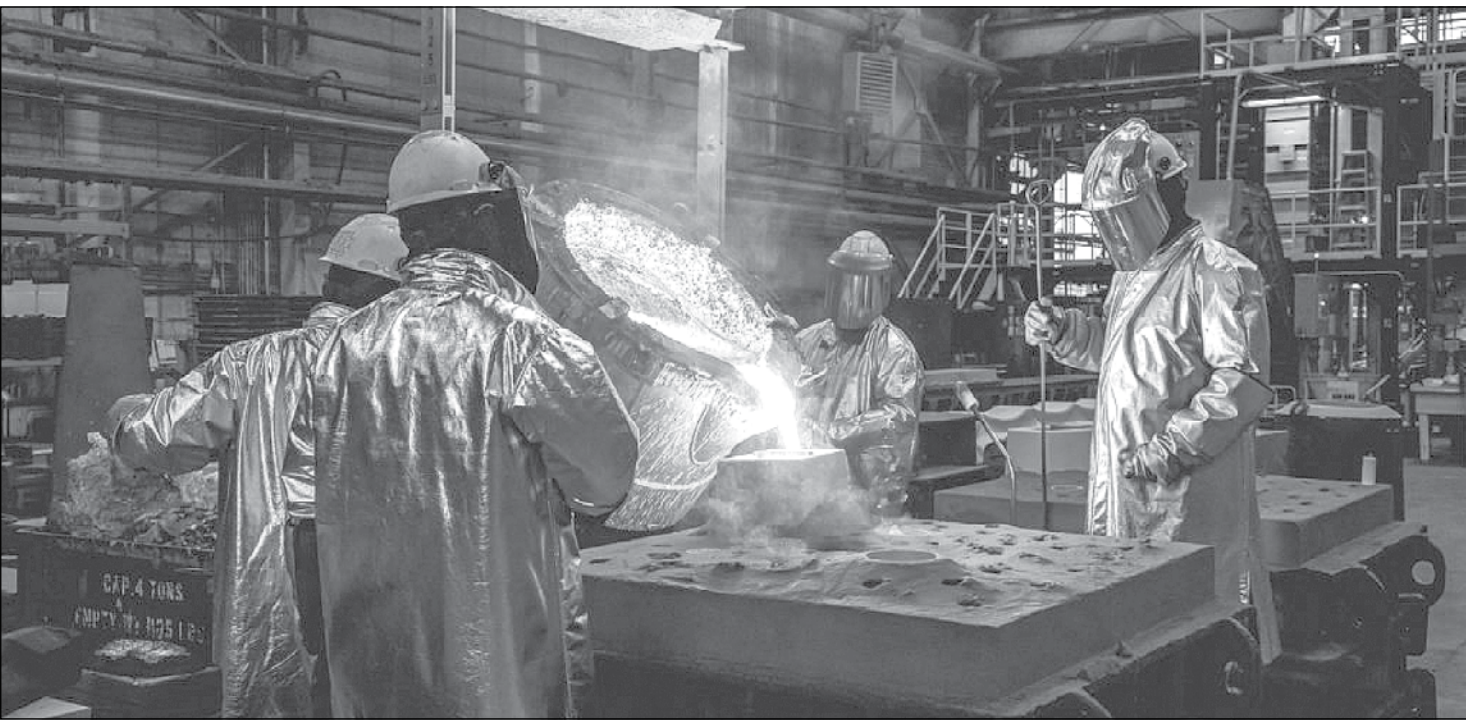
The Newport News Shipbuilding Foundry recently completed a pour of the first casting for USS Wisconsin (SSBN 827), the nation’s second Columbia -class submarine.