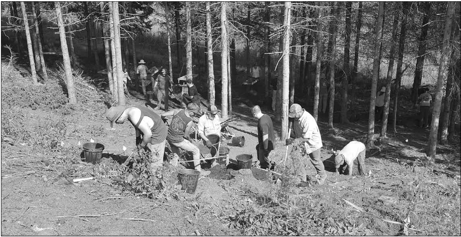
University of Wisconsin team members excavate units at the site of a World War II-era bomber crash located in Belgium, July 11, 2023.